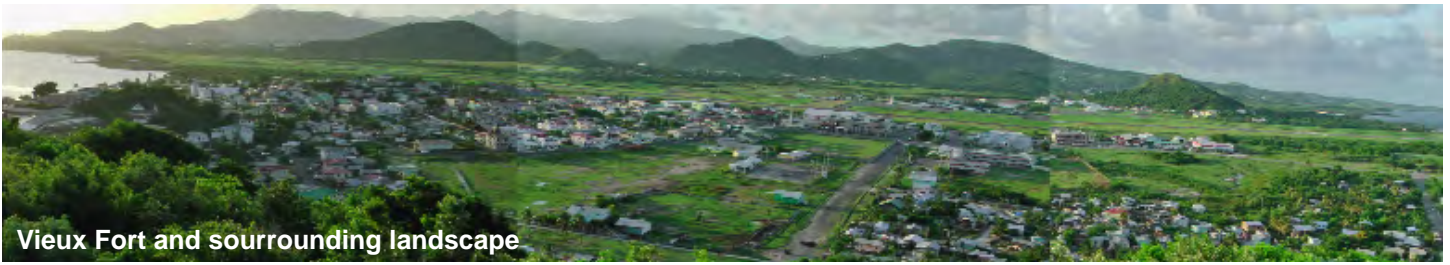
Vieux Fort and surrounding landscape

can further buttress St. Lucia's prominence as a world yachting center thereby increasing the island's yachting traffic from which all marinas will benefit.