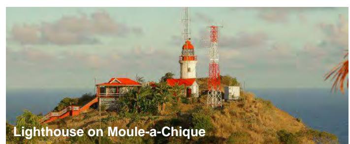
Lighthouse on Moule-a-Chique

Amerindian first occupation of the island and home to possibly the island's greatest concentration of Amerindian archeological sites and artifacts. The fascinating story of the Oliphe Blossom, a ship landed in Vieux Fort in 1605, represents the first recorded attempted English settlement in the Caribbean, and the St. Lucian Amerindians' first encounter with Europeans. Vieux Fort was the initial center of the island's sugar industry, and its Central Sugar Factory built in 1882 was one of the first such factories in St. Lucia and the Caribbean. Vieux Fort's history also speaks of World War II, when the Americans transformed the Vieux Fort landscape and seascape into a military base, leaving behind many vestiges of their military adventure. Indeed, it appears that Vieux Fort has served as the gateway to St. Lucia since time immemorial, the