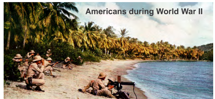
Americans during World War II

Vieux Fort's history is no less enchanting. It is the site of